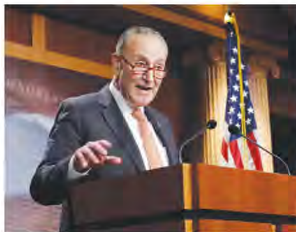
SCHUMER: Sen. Chuck Schumer, D-N.Y., speaks during a news conference with members of the House Democratic Caucus on Capitol Hill in Washington, D.C., on Tuesday, Dec. 8, 2020.

As part of the final deal, Schumer agreed that he will limit his use of parliamentary tactics to keep minority-party Republicans from offering amendments to bills.