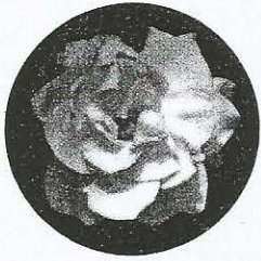
Village Flower "Gardenia"