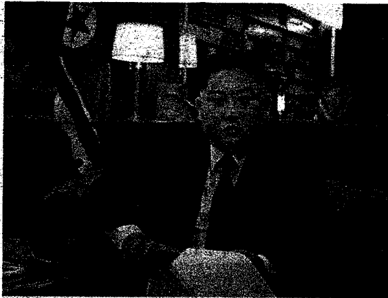
WAIT-AND-SEE APPROACH: North Korean leader Kim Jong Un poses for photos in Pyongyang in this Jan. 7 photo released by North Korea's Korean Central News Agency.

North Korea and the Obama administration to cease nuclear and missile tests in return for food aid broke down after Pyongyang launched a satellite rocket. Trump has set considerable store in a promise by Kim Jong Un to suspend testing, and said on Friday he said he would be "very disappointed" if testing resumed.