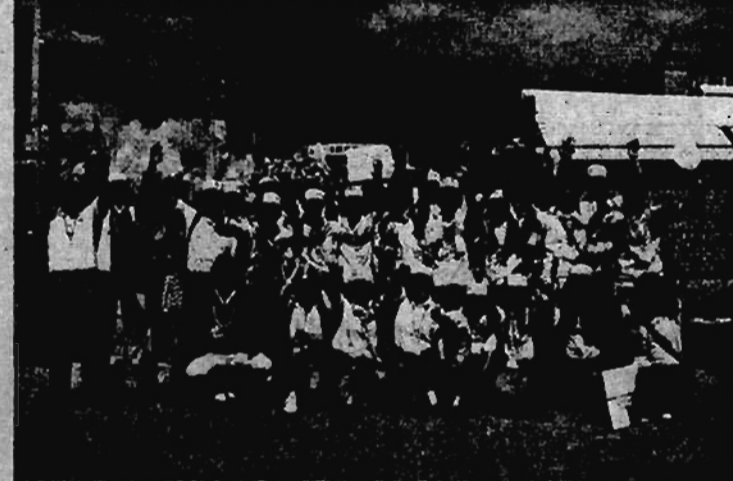
A Passengers of the MV Fuji Maru, which visited Salpan last week, pose for a souvanir photo

Fuji Maru and its sister ship Nippon Maru are now regularly used for cruises throughout the