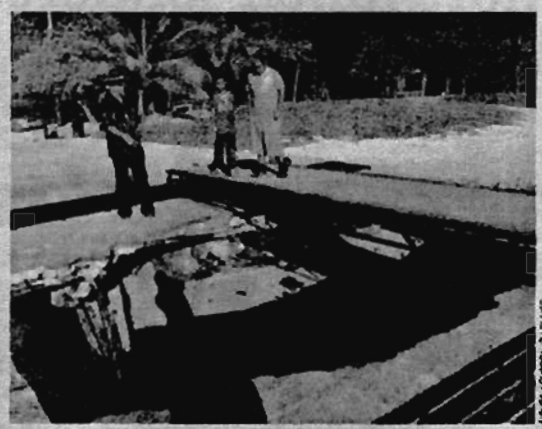
Jun Soblan and two bays stand next to the damaged portion of Sugar Dock.

SAIPAN - The Pantalan Boys, a group of local residents who frequent the Sugar Dock area, are again reminding the government about the danger posed by the unrepaired portion of the dock.