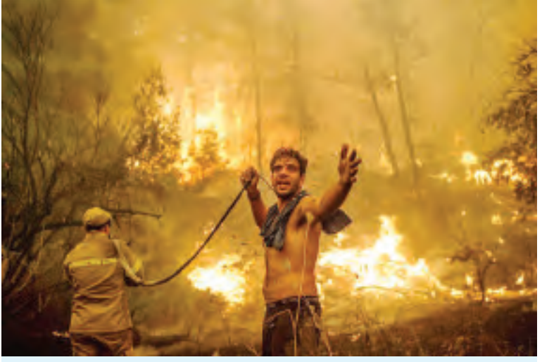
CLIMATE CRISIS: A local resident gestures as he holds an empty water hose during an attempt to extinguish forest fires approaching the village of Pefki on Evia island, Greece's second largest island, on Sunday.

assessment released on Monday is the work of more than